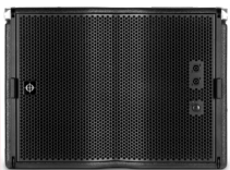
SCV-F Compact 18" Subwoofer with SC Technology