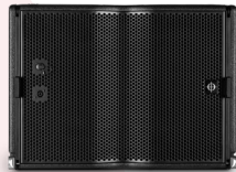
SC2-F Dual 15" Bass Extension with SC Technology