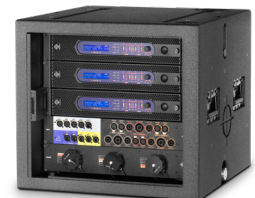
LINUS T-RACK 12-Channel Touring Rack